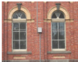
GAS REGULATING HOUSE SOHE 2008