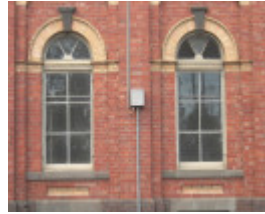
GAS REGULATING HOUSE SOHE 2008