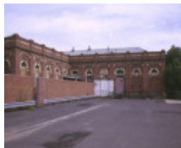
1 gas regulating house macaulay road north melbourne rear view apr1998