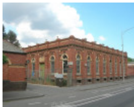
GAS REGULATING HOUSE SOHE 2008