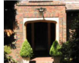
LITTLE MILTON SOHE 2008