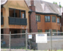
LITTLE MILTON SOHE 2008