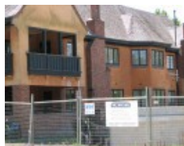
LITTLE MILTON SOHE 2008