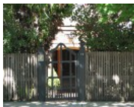
LITTLE MILTON SOHE 2008