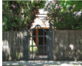
LITTLE MILTON SOHE 2008