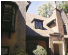
1 little milton albany road toorak front view feb1998