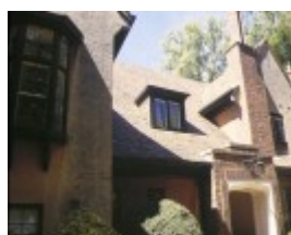
1 little milton albany road toorak front view feb1998