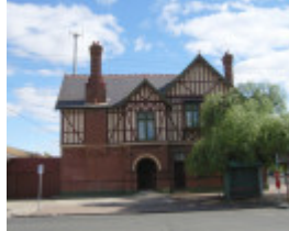
WARRACKNABEAL POST OFFICE SOHE 2008