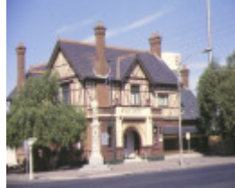
1 post office scott street warracknabeal front view mar1998