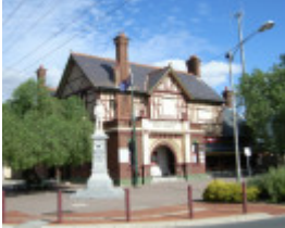
WARRACKNABEAL POST OFFICE SOHE 2008