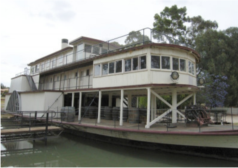
PADDLE STEAMER GEM SOHE 2008