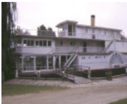
1 paddle steamer gem swan hill pioneer settlement swan hill side view may1998