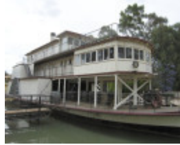
PADDLE STEAMER GEM SOHE 2008