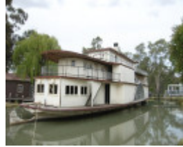
PADDLE STEAMER GEM SOHE 2008