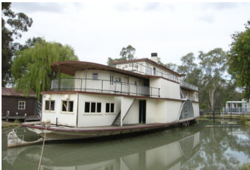
PADDLE STEAMER GEM SOHE 2008