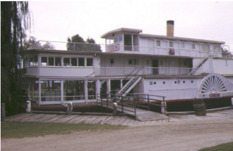
1 paddle steamer gam swan hill pioneer settlement swan hill side view may1998