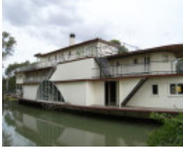
PADDLE STEAMER GEM SOHE 2008