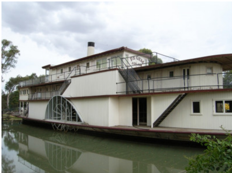
PADDLE STEAMER GEM SOHE 2008