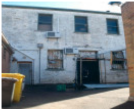
H01991 la mama theatre carlton from south 2002