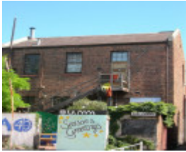
LA MAMA THEATRE BUILDING SOHO 2008