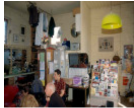
H01991 la mama theatre carlton first floor office dressing room west side 2002