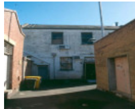
H01991 la mama theatre carlton from south row 2002