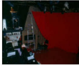
H01991 la mama theatre carlton east wall 2002