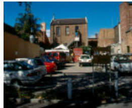
H01991 la mama theatre carlton from faraday street 2002