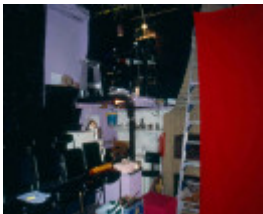
H01991 la mama theatre carlton north east corner 2002