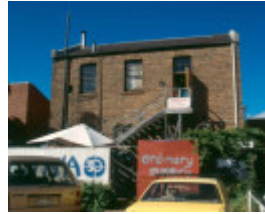
H01991 1 la mama theatre carlton 2002