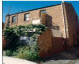
H01991 la mama theatre carlton from north west 2002