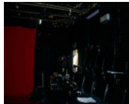
H01991 la mama theatre carlton north west corner 2002