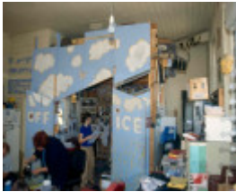
H01991 la mama theatre carlton first floor office dressing room east side 2002