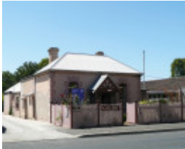
FORMER SHEARERS ARMS HOTEL SOHE 2008