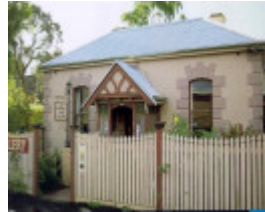
former shearers arms hotel aberdeen street geelong front elevation publication