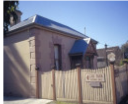
h00661 former shearers arms hotel aberdeen street geelong side view she project 2003