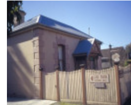
h00661 former shearers arms hotel aberdeen street geelong side view she project 2003