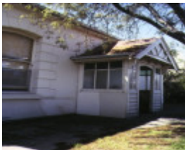
former shearers arms hotel aberdeen street geelong street front entrance