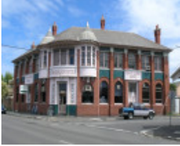
PRINCE ALBERT HOTEL SOHE 2008