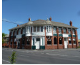
H1793 PRINCE ALBERT HOTEL LHA 2015 1.JPG