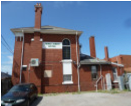
H1793 PRINCE ALBERT HOTEL LHA 2015 5.JPG