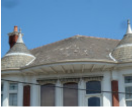
H1793 PRINCE ALBERT HOTEL LHA 2015 2.JPG