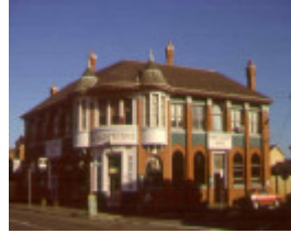
1 prince albert hotel williamstown pm2 aug99