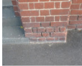
H1793 PRINCE ALBERT HOTEL LHA 2015 4.JPG