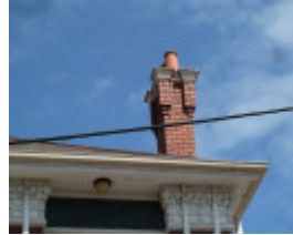
H1793 PRINCE ALBERT HOTEL LHA 2015 3.JPG