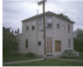
1 former bridge hotel thompson street williamstown front view sep1998