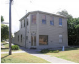
FORMER BRIDGE HOTEL SOHE 2008