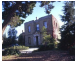
lunan house lunan avenue drumcondra front view