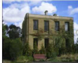
lunan house geelong west rear elevation lunan house apr1997