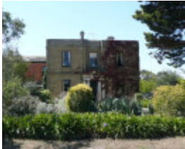
LUNAN HOUSE SOHE 2008