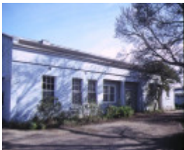
lunan house geelong west side view of wing jul1984