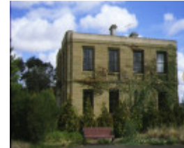
lunan house geelong west rear elevation lunan house apr1997