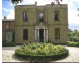
1 lunan house geelong west front elevation lunan house apr1997