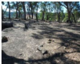
PENNYWEIGHT FLAT CEMETERY SOHE 2008