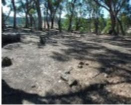
PENNYWEIGHT FLAT CEMETERY SOHE 2008