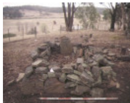
1 pennyweight flat cemetery colles road castlemaine top view may1997