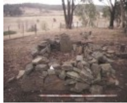
1 pennyweight flat cemetery colles road castlemaine top view may1997