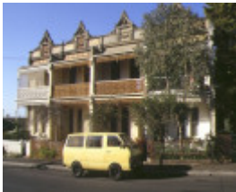
186 192 clarke street northcote front view sep1998