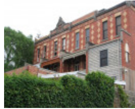
TERRACE HOUSES SOHE 2008