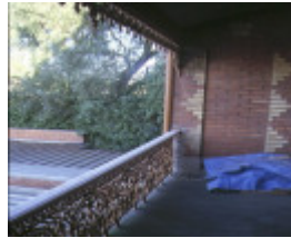
186 192 clarke street northcote balcony sep1998