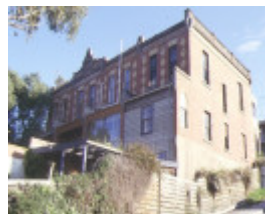
h01774 186 192 clarke street northcote rear elevation sep1998