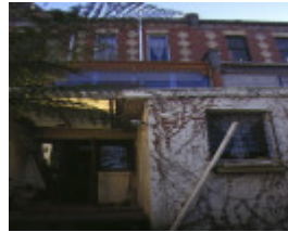
186 192 clarke northcote rear entrance sep1998