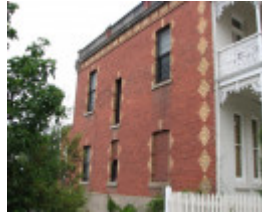
TERRACE HOUSES SOHE 2008