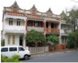
TERRACE HOUSES SOHE 2008