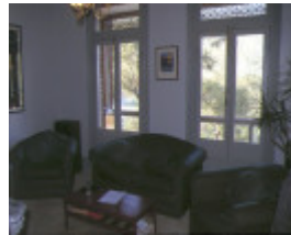
186 192 clarke street northcote interior sep1998