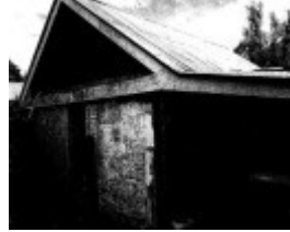
Detached store or early house from the south-east, showing shingle roof under added gabled roof