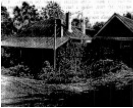
18.07 - Hazel Glen Residence & Outbuildings - Shire of Whittlesea Heritage Study 1991