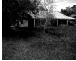
homestead from the west