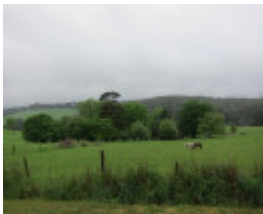
H0611 SILVERWELLS LHA 2015 3.JPG