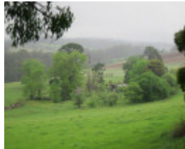
H0611 SILVERWELLS LHA 2015 1.JPG