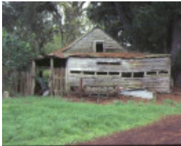
silverwells gembrook former post office & store