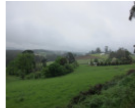
H0611 SILVERWELLS LHA 2015 2.JPG