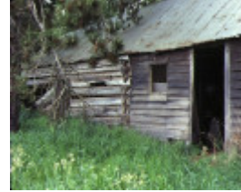
1 silverwells gembrook second house & dairy extension oct1980