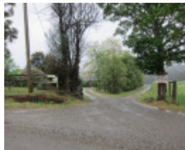
H0611 SILVERWELLS LHA 2015 4.JPG