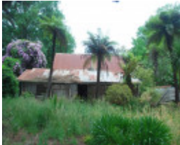
SILVERWELLS SOHE 2008