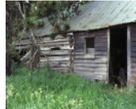
1 silverwells gembrook second house & dairy extension oct1980