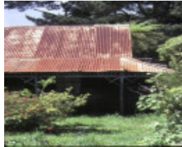
silverwells gembrook front entrance to third house oct1980