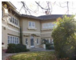
459 Glenferrie Road, Kooyong