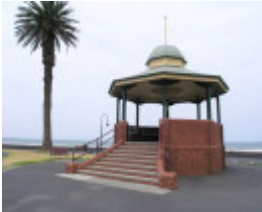
BAND ROTUNDA SOHE 2008