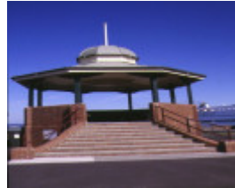
1 band rotunda beach street port melbourne front view apr1998