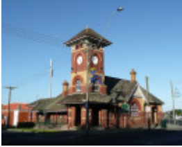
TERANG POST OFFICE SOHE 2008