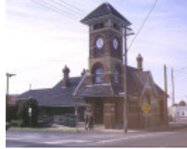
1 terang post office terang front view aug1998