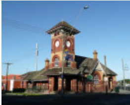
TERANG POST OFFICE SOHE 2008