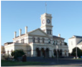
MARYBOROUGH POST OFFICE SOHE 2008