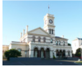
MARYBOROUGH POST OFFICE SOHE 2008