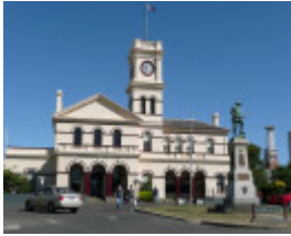
MARYBOROUGH POST OFFICE SOHE 2008