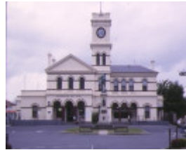
1 maryborough post office maryborough front view aug1998