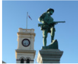
MARYBOROUGH POST OFFICE SOHE 2008