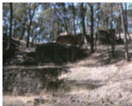
1 central cookman quartz gold mine st parkins reef road maldon landscape jun1997