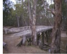
1 condidorios bridge koondrook