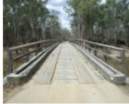
CONDIDORIOS BRIDGE SOHE 2008