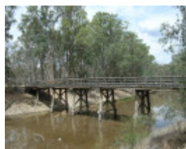
CONDIDORIOS BRIDGE SOHE 2008