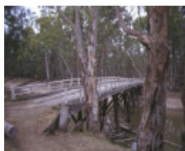
1 conditorios bridge koondrook