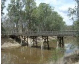
CONDIDORIOS BRIDGE SOHE 2008