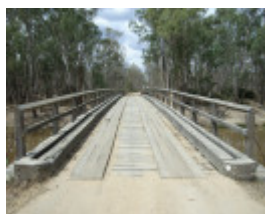
CONDIDORIOS BRIDGE SOHE 2008