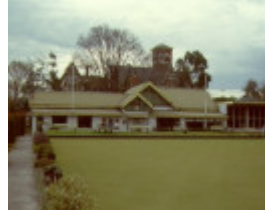
1 st kilda bowling club front across green