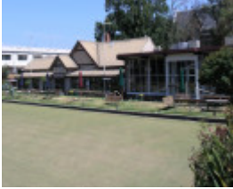
ST KILDA BOWLING CLUB SOHE 2008