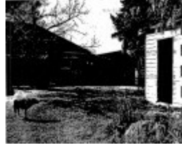
12.10 - Thornholme Residence 01 - Shire of Whittlesea Heritage Study 1991