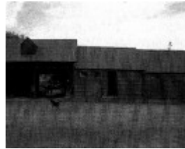
cart shed (altered) and stable complex to right