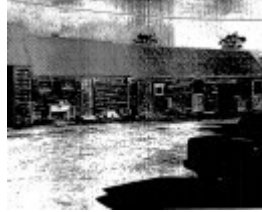
12.10 - Thornholme Residence 02 - Shire of Whittlesea Heritage Study 1991