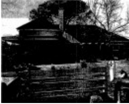
12.10 - Thornholme Residence - Shire of Whittlesea Heritage Study 1991