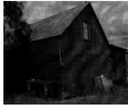
wool shed, from north-west with added skillion bay on south