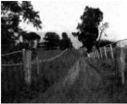
Thornholme, house and trees on left and stables on right of drive