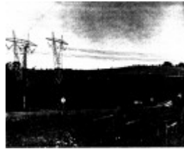
1 - Hawthorn Hedges in Kangaroo Ground03 - Shire of Eltham Heritage Study 1992