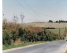
Hawthorn Hedges in Kangaroo Ground Colour 3 - Shire of Eltham Heritage Study 1992