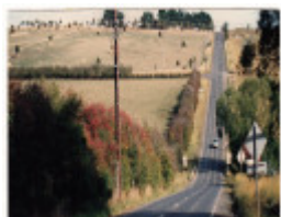
Hawthorn Hedges in Kangaroo Ground Colour 1 - Shire of Eltham Heritage Study 1992