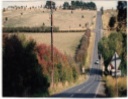
Hawthorn Hedges in Kangaroo Ground Colour 1 - Shire of Eltham Heritage Study 1992