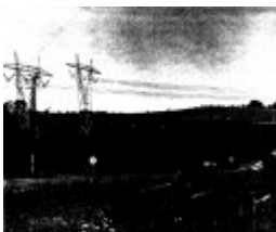
1 - Hawthorn Hedges in Kangaroo Ground03 - Shire of Eltham Heritage Study 1992