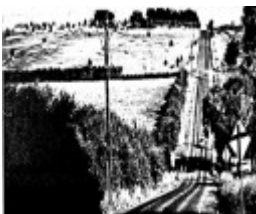
1 - Hawthorn Hedges in Kangaroo Ground - Shire of Eltham Heritage Study 1992