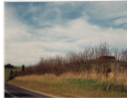
Hawthorn Hedges in Kangaroo Ground Colour 2 - Shire of Eltham Heritage Study 1992