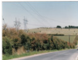
Hawthorn Hedges in Kangaroo Ground Colour 3 - Shire of Eltham Heritage Study 1992