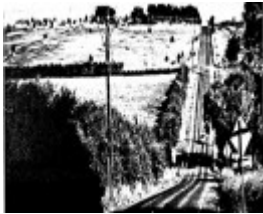
1 - Hawthorn Hedges in Kangaroo Ground - Shire of Eltham Heritage Study 1992