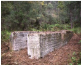
1 rose thistle & shamrock quartz mining precinct harrietville lower treatment plant