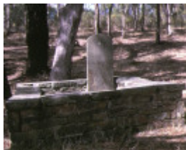
1 deadman's gully burial ground fryerstown grave stone