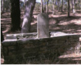
1 deadman's gully burial ground fryerstown grave stone