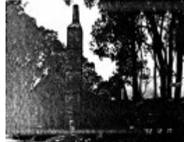
19 - Bizan Style Pottery Kiln 105 Barreenong Rd - Shire of Eltham Heritage Study 1992