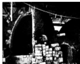
19 - Bizan Style Pottery Kiln 105 Barreenong Rd_07 - Shire of Eltham Heritage Study 1992