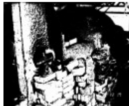
19 - Bizan Style Pottery Kiln 105 Barreenong Rd_05 - Shire of Eltham Heritage Study 1992