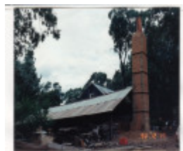
Bizan Style Pottery Kiln 105 Barreenong Rd Colour 7 - Shire of Eltham Heritage Study 1992