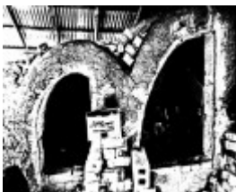
19 - Bizan Style Pottery Kiln 105 Barreenong Rd_06 - Shire of Eltham Heritage Study 1992