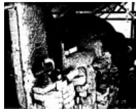
19 - Bizan Style Pottery Kiln 105 Barreenong Rd_04 - Shire of Eltham Heritage Study 1992