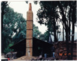
Bizan Style Pottery Kiln 105 Barreenong Rd Colour 1 - Shire of Eltham Heritage Study 1992