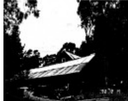
19 - Bizan Style Pottery Kiln 105 Barreenong Rd_02 - Shire of Eltham Heritage Study 1992