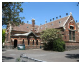
GLENFERRIE PRIMARY SCHOOL (PRIMARY SCHOOL NO.1508) SOHE 2008