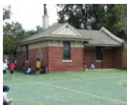
Glenferrie PS_caretakers cottage_27 Oct 07