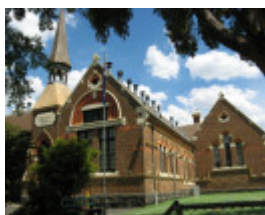
Glenferrie PS_1877 & 1887 extension_27 Oct 07