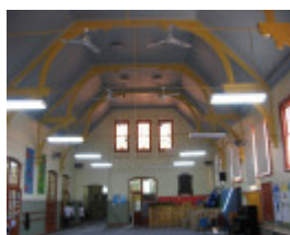
Glenferrie PS_Infants school interior_27 Oct 07