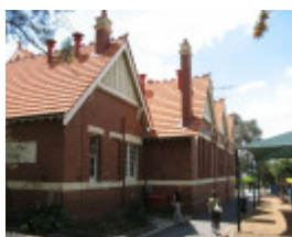
Glenferrie PS_Infants school exterior_27 Oct 07