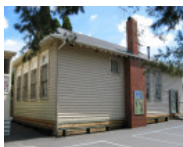
Glenferrie PS_sloyd room_27 Oct 07