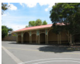
Glenferrie PS_shelter shed_27 Oct 07