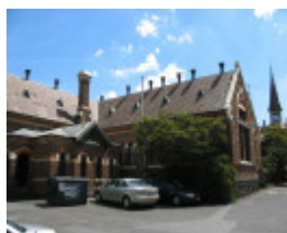
Glenferrie PS_1877 (R) & 1881 wing (L)_27 Oct 07