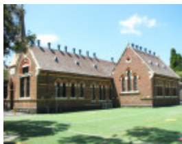
GLENFERRIE PRIMARY SCHOOL (PRIMARY SCHOOL NO.1508) SOHE 2008