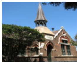
GLENFERRIE PRIMARY SCHOOL (PRIMARY SCHOOL NO.1508) SOHE 2008