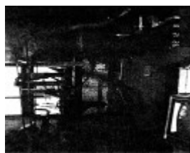
30 - Peter Garner MudBrickStudio andShed 62 Brougham St_04 - Shire of Eltham Heritage Study 1992