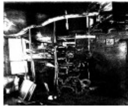
30 - Peter Garner MudBrickStudio andShed 62 Brougham St_03 - Shire of Eltham Heritage Study 1992