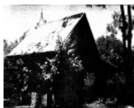
30 - Peter Garner MudBrickStudio andShed 62 Brougham St_07 - Shire of Eltham Heritage Study 1992