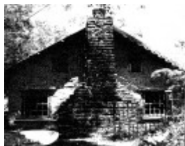
30 - Peter Garner MudBrickStudio andShed 62 Brougham St_02 - Shire of Eltham Heritage Study 1992