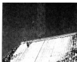
30 - Peter Garner MudBrickStudio andShed 62 Brougham St_08 - Shire of Eltham Heritage Study 1992