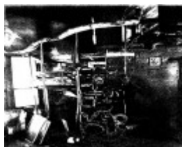
30 - Peter Garner MudBrickStudio andShed 62 Brougham St_03 - Shire of Eltham Heritage Study 1992