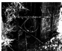
30 - Peter Garner MudBrickStudio andShed 62 Brougham St_09 - Shire of Eltham Heritage Study 1992