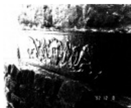
30 - Peter Garner MudBrickStudio andShed 62 Brougham St_06 - Shire of Eltham Heritage Study 1992