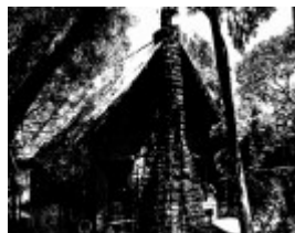
30 - Peter Garner Mud Brick Studio and Shed 62 Brougham St - Shire of Eltham Heritage Study 1992