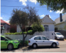
13-15 Stanhope Street, Armadale