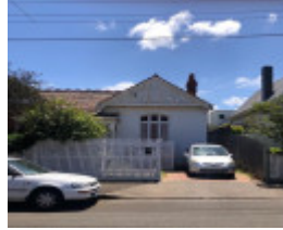
15 Stanhope Street, Armadale