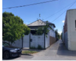
43 Lambeth Avenue, Armadale