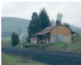
Gordon Railway Station 2004