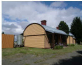
GORDON RAILWAY STATION SOHE 2008