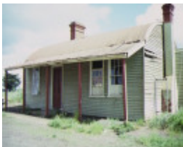
gordon railway station gowrie street gordon front view nov1986