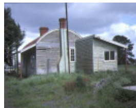
gordon railway station gowrie street gordon side view nov1986