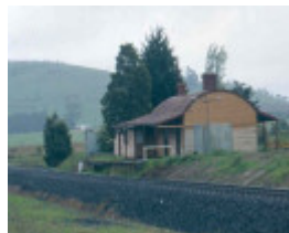
Gordon Railway Station 2004