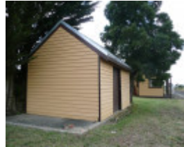
GORDON RAILWAY STATION SOHE 2008