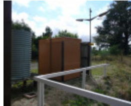
GORDON RAILWAY STATION SOHE 2008