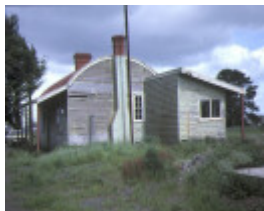
gordon railway station gowrie street gordon side view nov1986