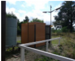
GORDON RAILWAY STATION SOHE 2008