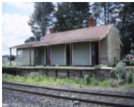
1 gordon railway station gowrie street gordon platform view nov1986