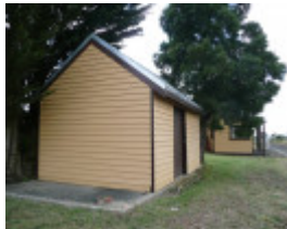
GORDON RAILWAY STATION SOHE 2008