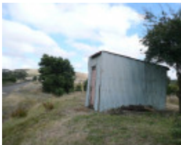
GORDON RAILWAY STATION SOHE 2008