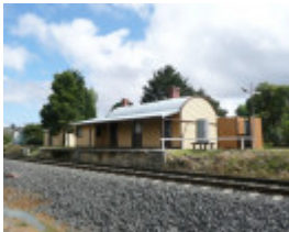
GORDON RAILWAY STATION SOHE 2008