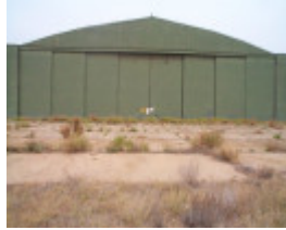
H01884 werribee satellite aerodrome feb2003