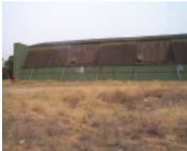
H01884 werribee satellite aerodrome3 feb2003