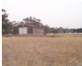
H01884 werribee satellite aerodrome site3