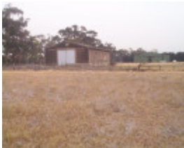
H01884 werribee satellite aerodrome site2