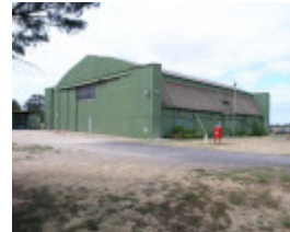
werribee satellite aerodrome hangar SOHE 2008