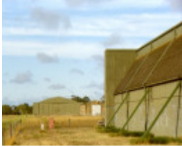
1 werribee satellite aerodrome mar00 pm1