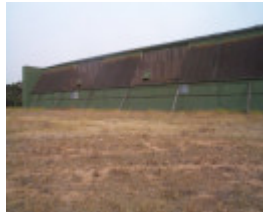
H01884 werribee satellite aerodrome4 feb2003