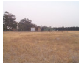
H01884 werribee satellite aerodrome site1