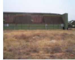
H01884 werribee satellite aerodrome2 feb2003