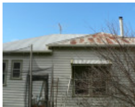
Gowan Brae, 1038 Bridge Road Teesdale, western elevation of Edwardian section