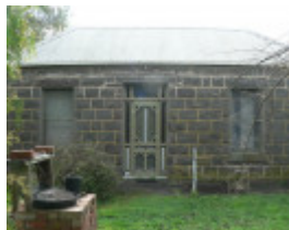
Gowan Brae, 1038 Bridge Road Teesdale