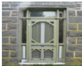
Gowan Brae, 1038 Bridge Road Teesdale, detail of front door