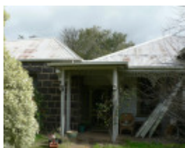
Gowan Brae, 1038 Bridge Road Teesdale, eastern elevation of Edwardian section