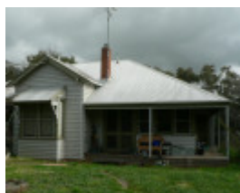
Gowan Brae, 1038 Bridge Road Teesdale, extension to Edwardian section