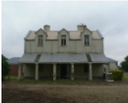
55587 Common Rd Inverleigh Lulotte 436