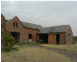
55587 Common Rd Inverleigh Lulotte stables 411