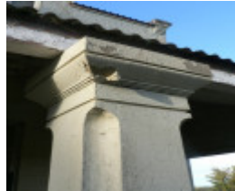
55587 Lullote Common Rd Inverleigh Doric capital 575