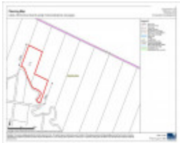
Extent of registration map