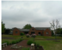
55587 Common Rd Inverleigh Lulotte stables 453