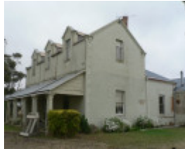
55587 Common Rd Inverleigh Lulotte 431