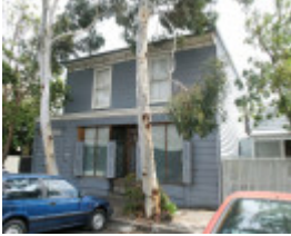
FORMER SHOP SOHE 2008