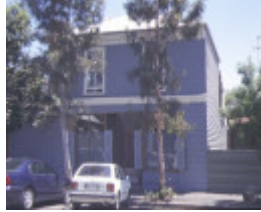
1 former shop & residence stokes street port melbourne front view nov1998