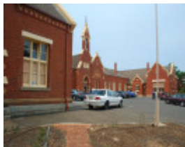
PRIMARY SCHOOL NO. 1566 SOHE 2008