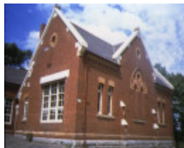
primary school number 1566 side view jan1993