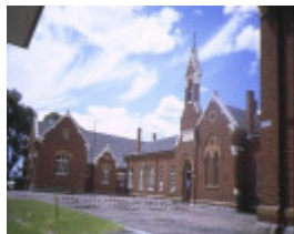
1 primary school number 1566 bendigo front view feb1993