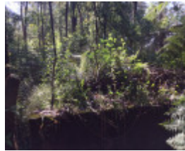
H1819 LOWER GOODWOOD KILNS LHA 2015 2.jpeg