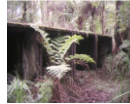
1 lower goodwood kilns upper l;a trobe valley piedmont front view aug1998