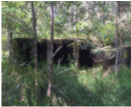
H1819 LOWER GOODWOOD KILNS LHA 2015 1.jpeg