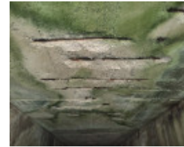
H1819 LOWER GOODWOOD KILNS LHA 2015 3.jpeg