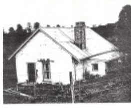
Souter House 19 Falkiner St Eltham Black & White 2 - Shire of Eltham Heritage Study 1992