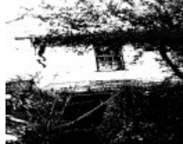
73 - Souter House 19 Falkiner St Eltham_05 - Original outside entry to the basement floor at the south east corner of the building in 1949. The ground in front of the Souter House was excavated and removed in recent years by the present owners - Shire of