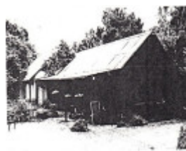
Souter House 19 Falkiner St Eltham Black & White 1 - Shire of Eltham Heritage Study 1992