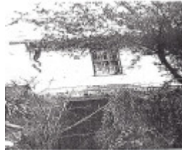
Souter House 19 Falkiner St Eltham Black & White 3 - Shire of Eltham Heritage Study 1992