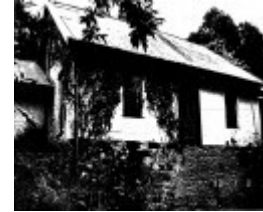
73 - Souter House 19 Falkiner St Eltham_07 - Shire of Eltham Heritage Study 1992