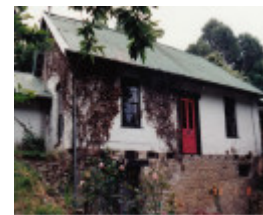
Souter House 19 Falkiner St Eltham Colour 1 - Shire of Eltham Heritage Study 1992