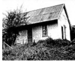
73 - Souter House 19 Falkiner St Eltham_02 - Souter House in 1949 - Shire of Eltham Heritage Study 1992