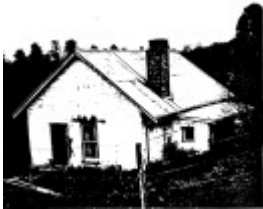
73 - Souter House 19 Falkiner St Eltham_04 - North West (rear corner) of the Souter House in 1949 - Shire of Eltham Heritage Study 1992