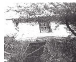
Souter House 19 Falkiner St Eltham Black & White 3 - Shire of Eltham Heritage Study 1992