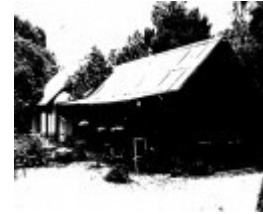
73 - Souter House 19 Falkiner St Eltham_03 - Souter House present day - Shire of Eltham Heritage Study 1992