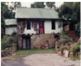
Souter House 19 Falkiner St Eltham Colour 3 - Shire of Eltham Heritage Study 1992