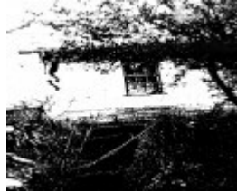
73 - Souter House 19 Falkiner St Eltham_05 - Original outside entry to the basement floor at the south east corner of the building in 1949. The ground in front of the Souter House was excavated and removed in recent years by the present owners - Shire of