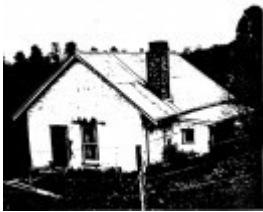
73 - Souter House 19 Falkiner St Eltham_04 - North West (rear corner) of the Souter House in 1949 - Shire of Eltham Heritage Study 1992