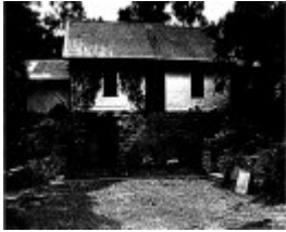
73 - Souter House 19 Falkiner St Eltham - Shire of Eltham Heritage Study 1992