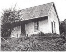
Souter House 19 Falkiner St Eltham Black & White 4 - Shire of Eltham Heritage Study 1992