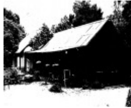
73 - Souter House 19 Falkiner St Eltham_03 - Souter House present day - Shire of Eltham Heritage Study 1992