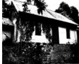
73 - Souter House 19 Falkiner St Eltham_07 - Shire of Eltham Heritage Study 1992