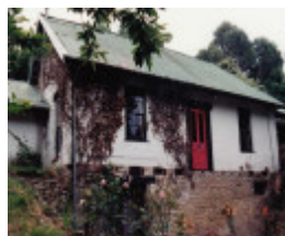
Souter House 19 Falkiner St Eltham Colour 1 - Shire of Eltham Heritage Study 1992