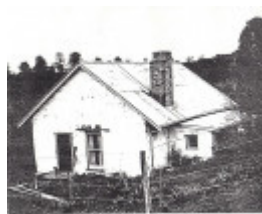
Souter House 19 Falkiner St Eltham Black & White 2 - Shire of Eltham Heritage Study 1992