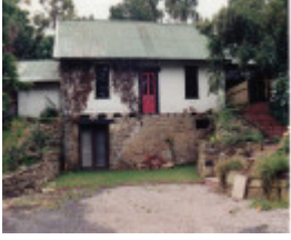
Souter House 19 Falkiner St Eltham Colour 3 - Shire of Eltham Heritage Study 1992