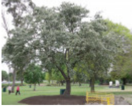
1_Azarole tree replanted in Victory Park