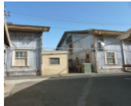
H1790 FORMER MELBOURNE HARBOUR TRUST WILLIAMSTOWN WORKSHOPS LHA 2015 3.JPG