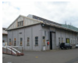
Before Photograph - Reference F3916 2014