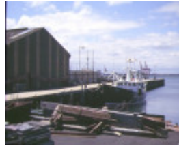
1 former melbourne harbor trust workshops ann street williamstown boyd jetty jan1999