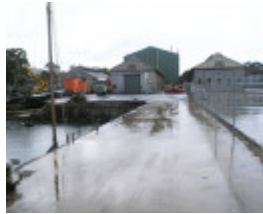
FORMER MELBOURNE HARBOUR TRUST WILLIAMSTOWN WORKSHOPS SOHE 2008