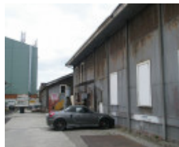
Before Photograph - Reference F3916 2014