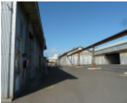
H1790 FORMER MELBOURNE HARBOUR TRUST WILLIAMSTOWN WORKSHOPS LHA 2015 2.JPG