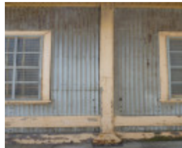
H1790 FORMER MELBOURNE HARBOUR TRUST WILLIAMSTOWN WORKSHOPS LHA 2015 4.JPG