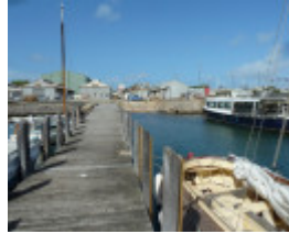
H1790 FORMER MELBOURNE HARBOUR TRUST WILLIAMSTOWN WORKSHOPS LHA 2015 1.JPG