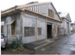
FORMER MELBOURNE HARBOUR TRUST WILLIAMSTOWN WORKSHOPS SOHE 2008