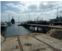
H1790 FORMER MELBOURNE HARBOUR TRUST WILLIAMSTOWN WORKSHOPS LHA 2015 5.JPG