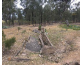
2017_Collapsed latrine pits_F8.jpg