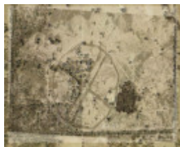
1949 aerial overlaid with present day image.jpg