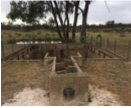
2017_Water treatment plant_F4.jpg