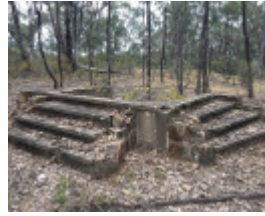
2017_Guards Quarters steps_F13.jpg