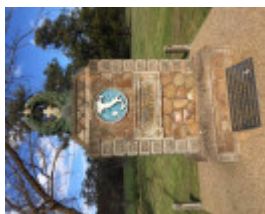
2017_Italian memorial relocated from Camp 13.jpg