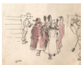
Sketches by Hans-Wolter von Gruenewaldt.jpg