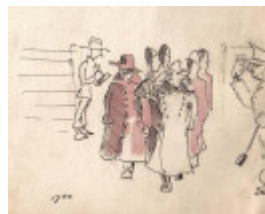
Sketches by Hans-Wolter von Gruenewaldt.jpg