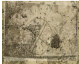
1949 aerial overlaid with present day image.jpg