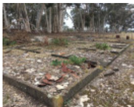
2017_Concrete floor slabs_F8.jpg