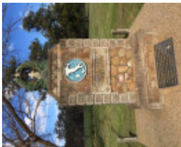
2017_Italian memorial relocated from Camp 13.jpg