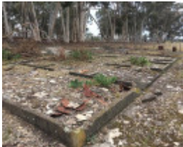
2017_Concrete floor slabs_F8.jpg