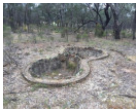
2017_Figure eight pond_F15.jpg