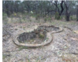
2017_Figure eight pond_F15.jpg