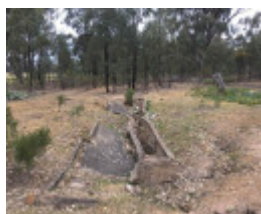
2017_Collapsed latrine pits_F8.jpg