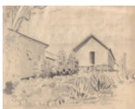
Sketch by Hans-Wolter von Gruenewaldt.jpg