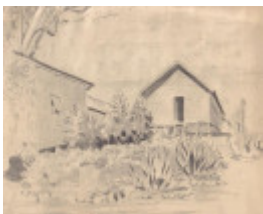
Sketch by Hans-Wolter von Gruenewaldt.jpg