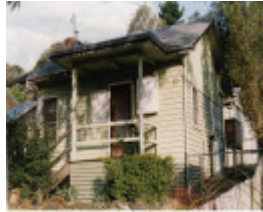
Hurstbridge Police Station Lock Up Residence Colour 2 - Shire of Eltham Heritage Study 1992