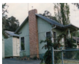
Hurstbridge Police Station Lock Up Residence Colour 3 - Shire of Eltham Heritage Study 1992