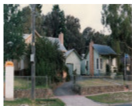
Hurstbridge Police Station Lock Up Residence Colour 1 - Shire of Eltham Heritage Study 1992