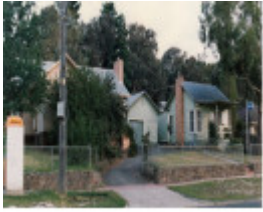
Hurstbridge Police Station Lock Up Residence Colour 1 - Shire of Eltham Heritage Study 1992