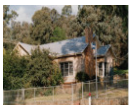
Hurstbridge Police Station Lock Up Residence Colour 4 - Shire of Eltham Heritage Study 1992