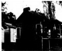
95 - Hurstbridge Police Station Lock Up Residence_03 - Shire of Eltham Heritage Study 1992