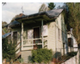
Hurstbridge Police Station Lock Up Residence Colour 2 - Shire of Eltham Heritage Study 1992