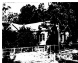
95 - Hurstbridge Police Station Lock Up Residence_04 - Shire of Eltham Heritage Study 1992