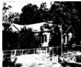
95 - Hurstbridge Police Station Lock Up Residence_04 - Shire of Eltham Heritage Study 1992