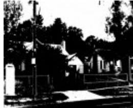
95 - Hurstbridge Police Station Lock Up Residence - Shire of Eltham Heritage Study 1992