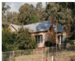
Hurstbridge Police Station Lock Up Residence Colour 4 - Shire of Eltham Heritage Study 1992