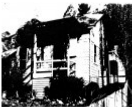
95 - Hurstbridge Police Station Lock Up Residence_02 - Shire of Eltham Heritage Study 1992