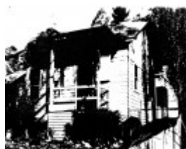
95 - Hurstbridge Police Station Lock Up Residence_02 - Shire of Eltham Heritage Study 1992