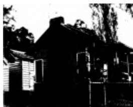
95 - Hurstbridge Police Station Lock Up Residence_03 - Shire of Eltham Heritage Study 1992