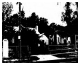
95 - Hurstbridge Police Station Lock Up Residence - Shire of Eltham Heritage Study 1992