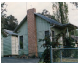
Hurstbridge Police Station Lock Up Residence Colour 3 - Shire of Eltham Heritage Study 1992