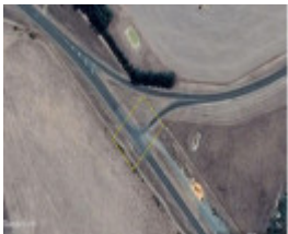
Milepost A - aerial diagram