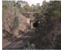
1 big hill railway precinct bendigo tunnel portal apr1998