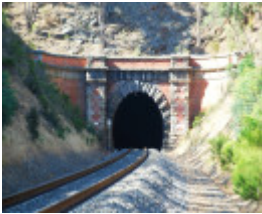
big hill railway precinct bendigo coliban system water race apr1998