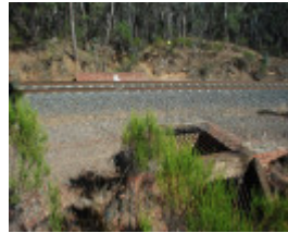
BIG HILL RAILWAY PRECINCT (MURRAY VALLEY RAILWAY, MELBOURNE TO ECHUCA) SOHE 2008