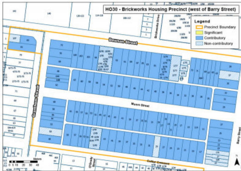
Brickworks Housing Precinct (west of Barry Street)