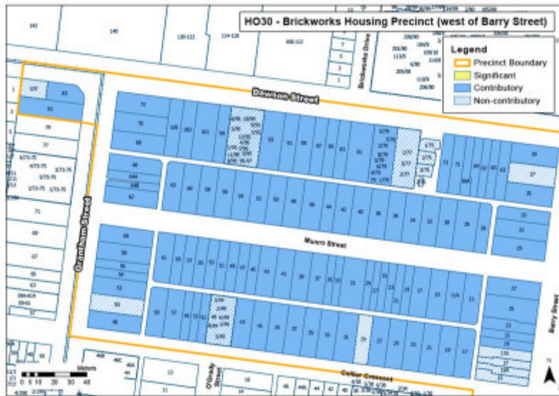
Brickworks Housing Precinct (west of Barry Street)