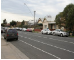
Dawson St looking E.JPG