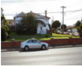
483 Brunswick Rd West