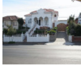
485 Brunswick Rd West