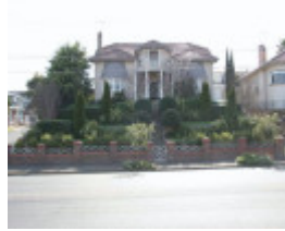
489 Brunswick Rd West