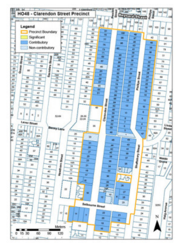
Clarendon Street Precinct Map