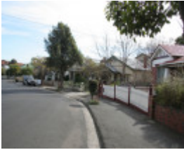
Collier Cr looking E