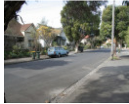
Collier Cr looking E(2)