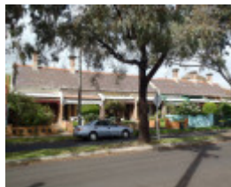
68-48 Donald St Brunswick