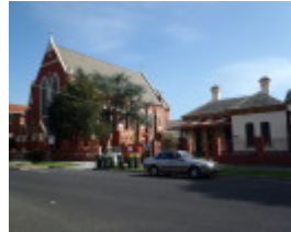
47-51 Mitchell St Brunswick