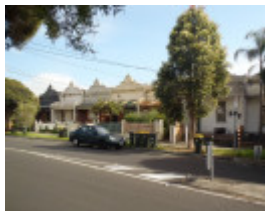
61-71 Mitchell St Brunswick