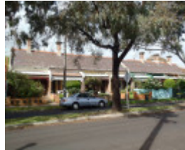
68-48 Donald St Brunswick