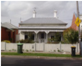
84 Donald St Brunswick