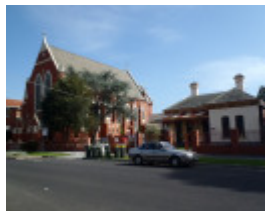
47-51 Mitchell St Brunswick