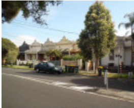
61-71 Mitchell St Brunswick