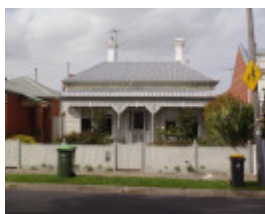
84 Donald St Brunswick