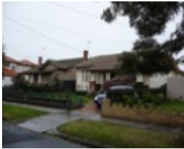
SOMALI ST NTH SIDE 2