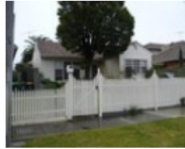
FONTAINE 18 POSTWAR