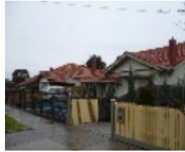
SOMALI ST STH SIDE