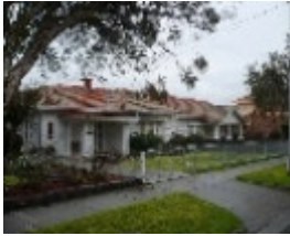
SOMALI STREET STH SIDE 2