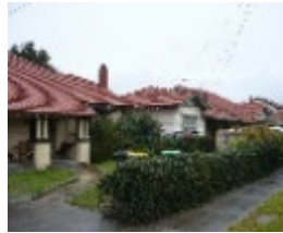
Somali Street south side