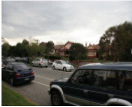
Mid-Park St looking W