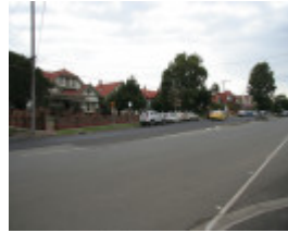
Park Street looking E