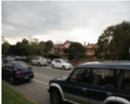
Mid-Park St looking W